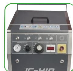
USER FRIENDLY CONTROL PANEL