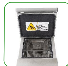
INSULATED HOPPER (31 KG CAPACITY)